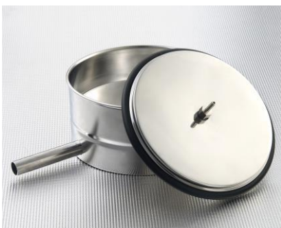
Kit for wet sieving