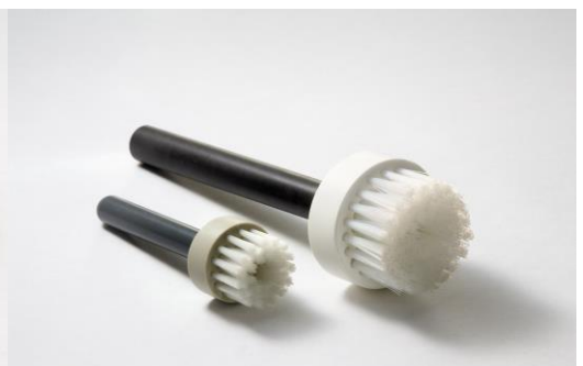
Brushes for cleaning